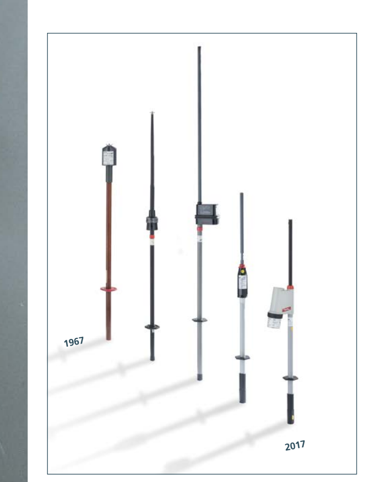
More than 50 years of experience: From the first voltage detector until today.

Our voltage detectors have been standing for quality and safety for decades. Rely on the highest standards and our long-standing experience in developing and manufacturing safety devices for work on electrical installations.